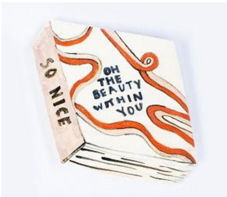
Sekar Puti some reading for self love , 2017 ceramic, various dimensions