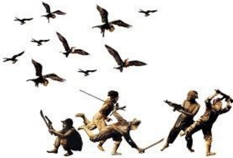
Maharani Mancanagara Babad hikayat wanatentrem #6, 2018 charcoal on wood 190 x 240 x 15 cm