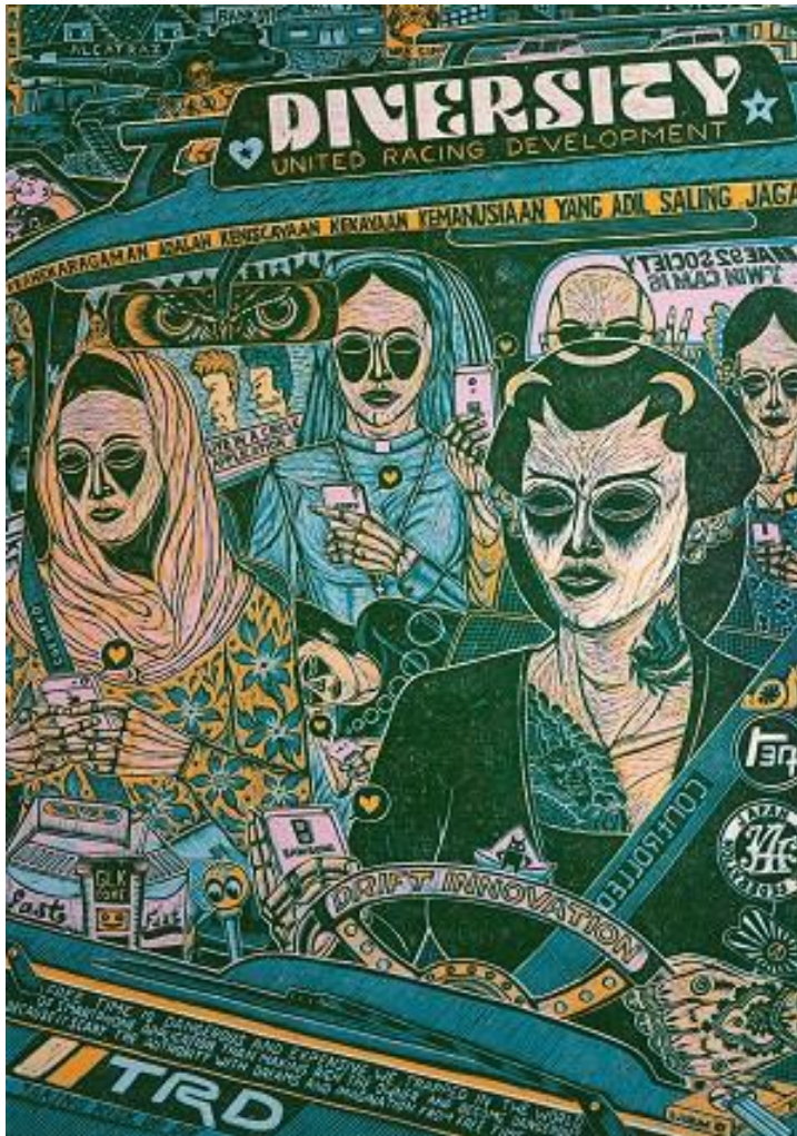
Mohamad 'Ucup' Yusuf On the way , 2018 reduction woodblock print, Edition 6 90 x 61 cm