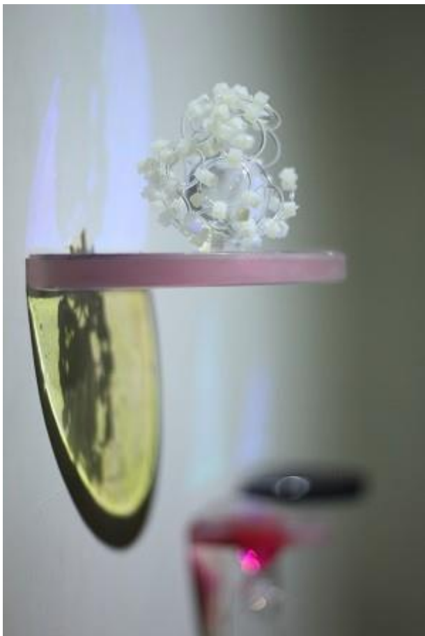
Fika Ria Santika Tumpuk lapis, tampak isi: Bayang 2, 2018 resin, acrylic, pigment, nylon, beads, spotlight, stainless steel 25 x 10 cm each (13 pieces)