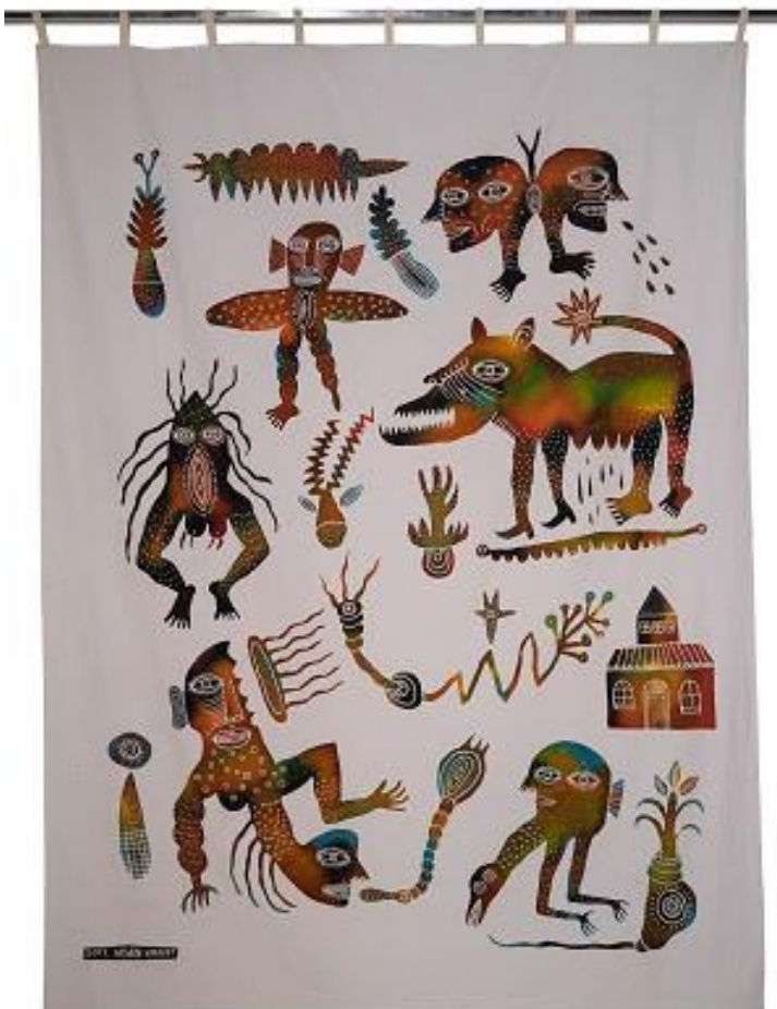
Arwin Hidayat Kadang malam kadang siang #3, 2016 batik on primisima 196 x 147 cm